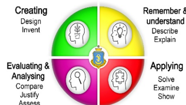
Our Key Stage 1 & 2 Learning Wheel